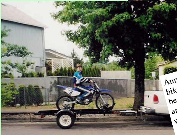
The Kiper Boys couldn't stop smiling